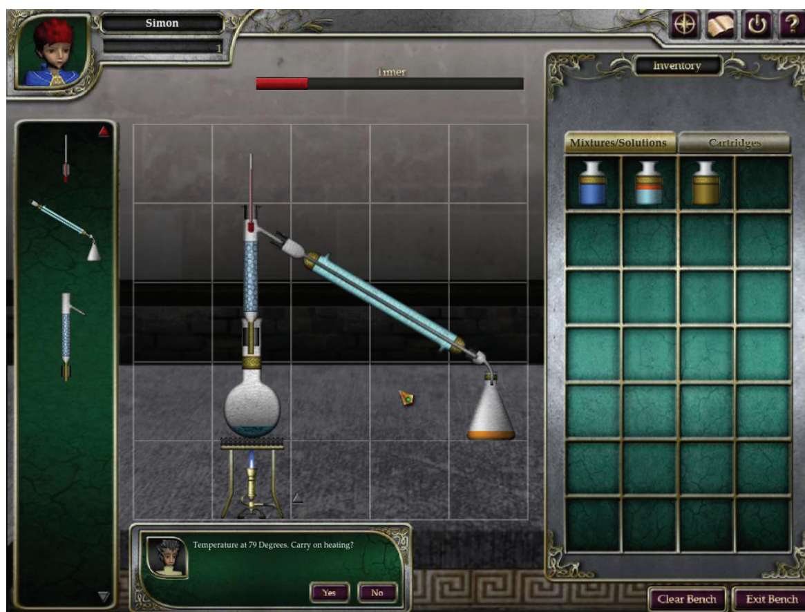
Figure 2: Players trying to separate a mixture comprising two liquids using fractional distillation in the virtual chemistry lab

their cumulative learning experiences, in and out of the game, so as to be able to articulate knowledge claims in more generalizable and parsimonious terms.