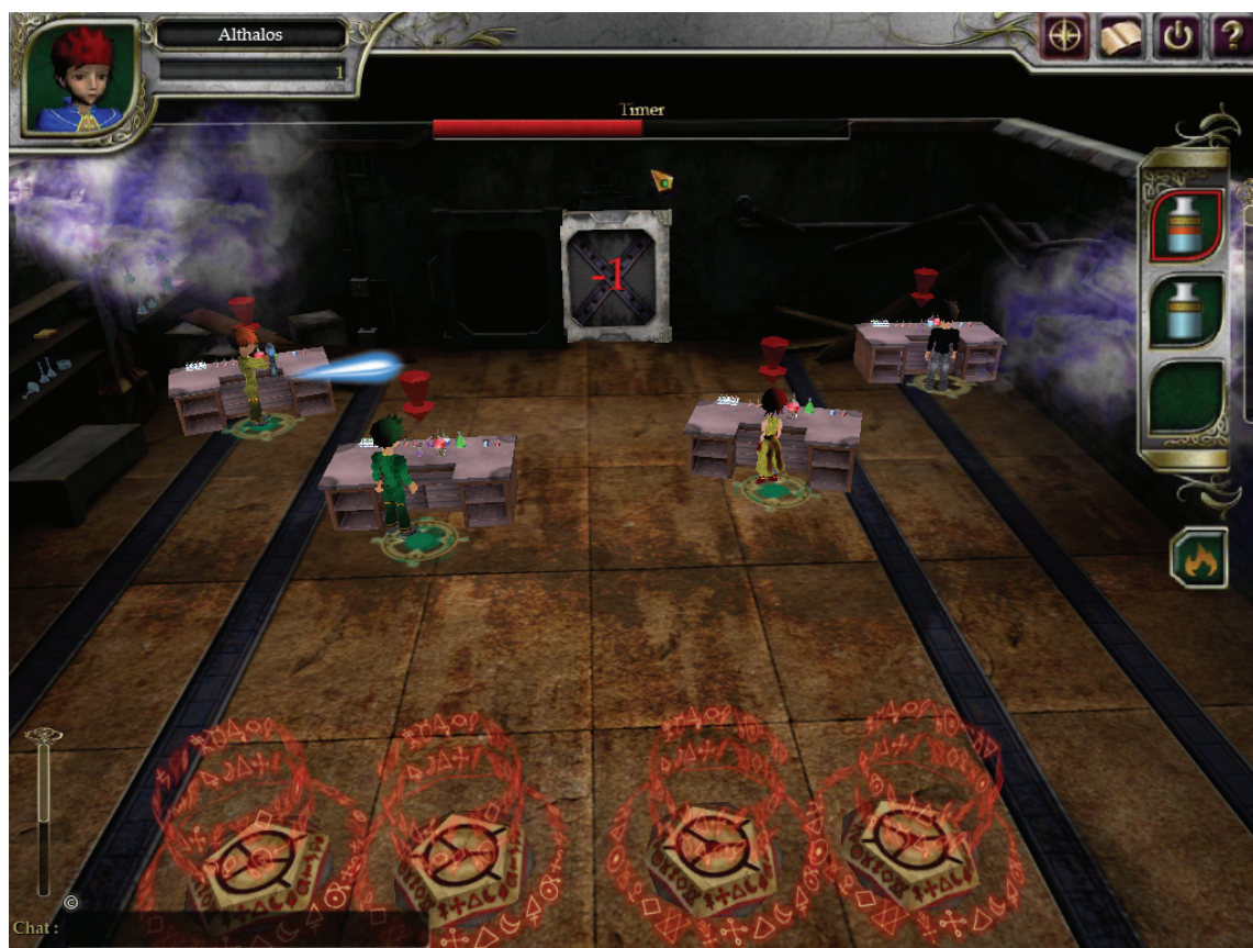
Figure 1: Players trapped in the underground chemistry lab

Teleporting to the virtual chemistry lab (see Figure 2), the players engage in carrying out separation techniques on their own. Figure 2 shows a player attempting fractional distillation with a mixture of immiscible liquids (indicated by the orange upper layer resting on the lower blue layer). Based on the game design, the simplest method of separating immiscible liquids is by using a separating funnel. The underlying pedagogy of game-based learning employed here, however, explicitly encourages students to experiment with multiple approaches to solving a problem so that students can derive a concrete sense of what works in relation to what does not work and, most importantly, to determine why. At times, there may be more than one functional solution. As curriculum designers, we want students to consider which solution should be regarded as the “better” solution and on what grounds.