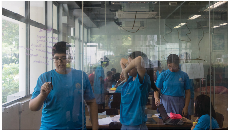
COLLABORATION WORKS: Exposure to greater opportunities for collaborative learning allows more meaningful learning.

Cleveland et al. (2018) notes that school design (and correspondingly library design) should be purposeful, taking into account the observed and anticipated needs of each school. Mobile and flexible furniture, while