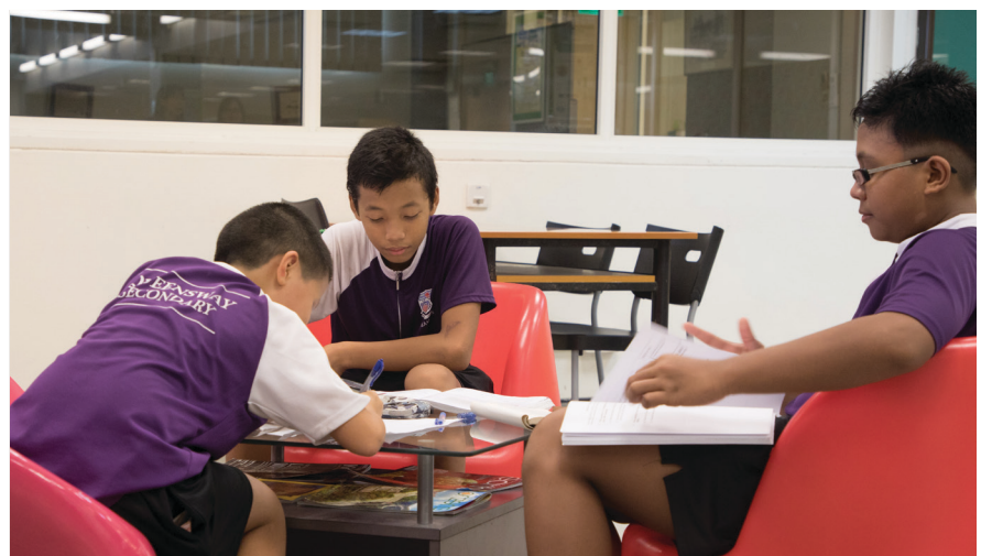
STUDYING AS CORE: Students often view and use the library as a safe space to study in. Space must be made available for students to study.

Providing instruction on study skills may also be another way schools can help students who may not have the resources or guidance to develop good study habits (Jato, Ogunniyi,