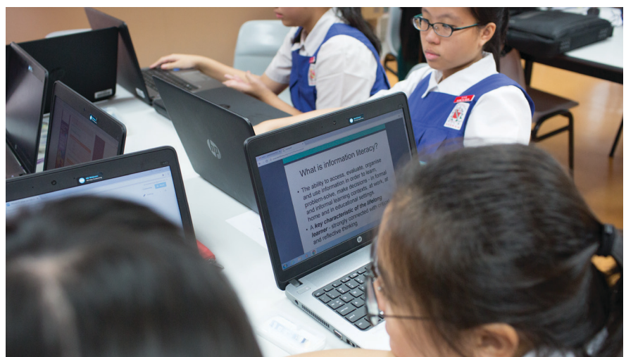
THE FUTURE IS RESEARCH: School libraries need to ensure that sufficient resources are allocated for students to research effectively.

Access to online databases (whether subscribed by the school or through partnership with public