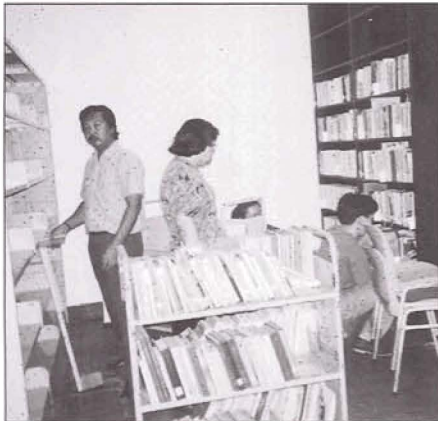
The Chinese books being transferred to the former Closed Stack Room on the third floor

had said, it was really quite simple. The library was getting too small for its books. Space had to be found and shelves had to be bought. The literature books in "PR" and "PS" were squeezing out the science and maths books in "Q" and "QA". From Reference to the third floor, shelves were packed tight.