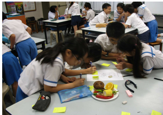
Figure 2: Students in an enculturation activity based on the theme of Fruits

the final lesson was based on the topic of Habitats so as to keep close to the science curriculum as possible. Hence, as the activities were fun, familiar and easy, students master the enculturation's learning objectives without much difficulty. We also discover that, not only pedagogical and student learning aspects were accomplished but the attitudes of teachers and students (TAPS) took a positive impression of GS technology. With this, students and teachers waited in eager anticipation of GS lessons.