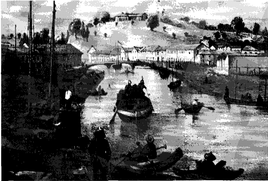
Plate 1 : Singapore River in 1843