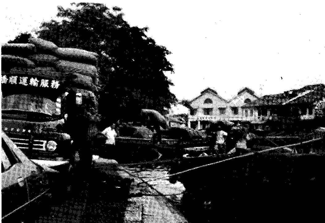
Plate 4 : Economic activities along the Singapore River