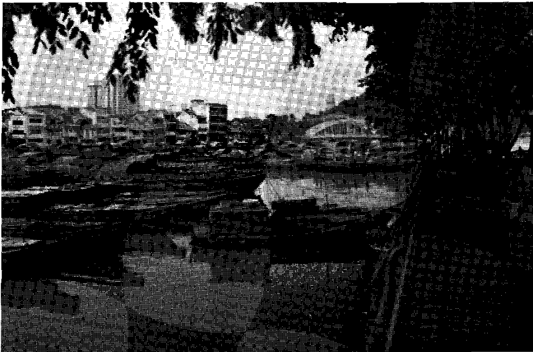
Plate 2 : Singapore River in 1982