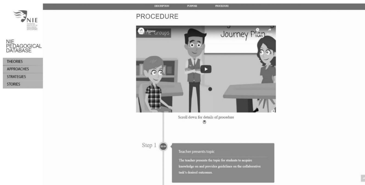
Figure 2: Screenshot of the Procedure section of the 'Jigsaw' strategy page from 'NIE Pedagogical Database'

Committee that comprises of a representative from each academic group provided feedback for enhancements and extensions to the prototype. Thus, the initial prototype reflected ideas of both the learning designers as well as the teacher educators.