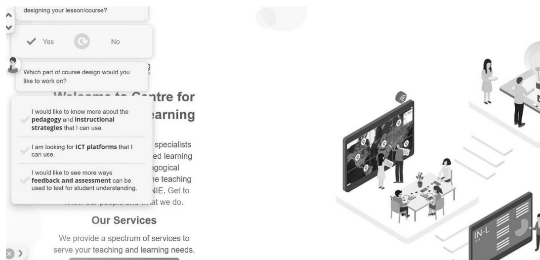
Figure 4: Pre-programmed questions in a conversation with Tessa

The chatbot used in our context was named 'Tessa'. This chatbot was derived by an online chatbot platform Quriobot. Several approaches can be used to add knowledge to a chatbot created using Quriobot. One possible approach is to use an existing sample bot by Quriobot. For Tessa, an empty database to which chatbot designer program the database so that it has pre-programmed questions, phrases or words and how it is to respond to each question, phrase or word (refer to Figure 4). The options selected by users are captured in the backend report enabling the chatbot designer to learn from user inputs on possible knowledge and skills gaps.