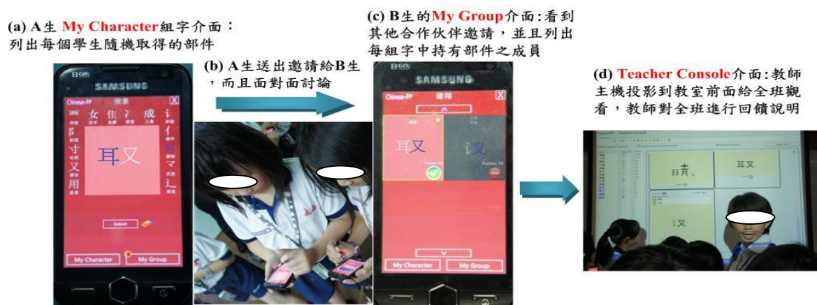
Figure 2 Mobile assisted Chinese-PP game interface

teacher console. The teacher then provided feedback on the answers through the teacher console and awarded scores of 10 points to each student for each correct character formed by a pair of students (20 points each for a group of 3 students, 30 points each for a group of 4 students; where the larger the group of which a correct character was formed, the higher the points each student will score). The screen also reflected the accumulative scores of all students (figure 2d). In addition, the teacher gathered the students frequently to look at the characters formed by the students, asking them for the character pronunciation, and stimulating their thinking and providing appropriate hints to facilitate the continuation of the character formation. At the end of the first round of the game (approximately 10 to 15 minutes), the groups were disbanded. Students then proceeded to round 2 where the system assigned another batch of character components to the students.