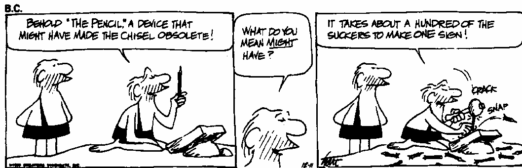
Figure 1.1 B.C. Comic Strip

flexible and dynamic curriculum by taking into account new teaching methods that were made possible by technology (Ministry of Education, 2003). This was a different approach from the current practice of using IT to support an existing curriculum. The mp2 would also seek to change the current predominant pedagogy of a teacher-centred use of IT to a more pupil-centred strategy for learning.