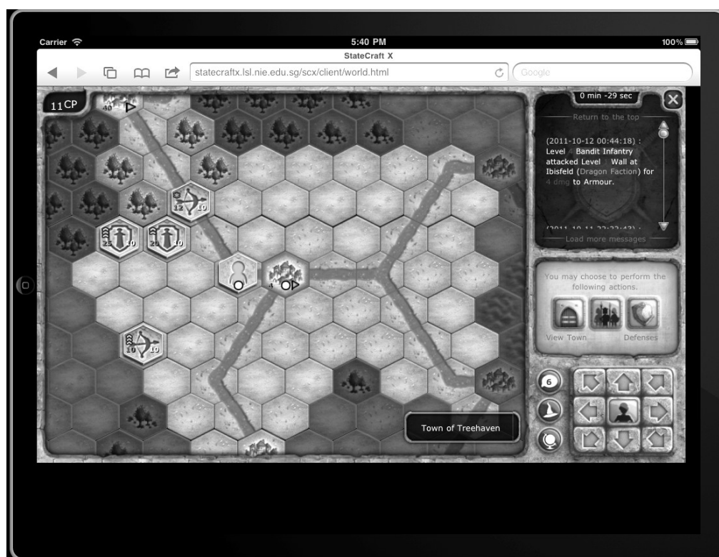
Figure 3: View of the game's web-based world map played on a tablet computer

on citizens' happiness as they are worked harder, paid less, or taxed more highly. As a game, therefore, a complex simulation with multiple embedded interdependencies runs continuously. Outcomes can play out in many different and often unpredictable ways for players. Through careful game balancing, several patterns of play typically emerge. The tension between achieving economic wealth and increasing citizen happiness is one such pattern. These tensions are the triggers for productive dialog. How can the challenges that players experience be dealt with? There are no right answers. There are only better or worse solutions, and these solutions are always contingent on what other players do as well as on game events that players have no control over. Such events include the influx of refugees, epidemics, bandit attacks, and invasion by a neighboring kingdom. Playing the game, students learn that effective governance is a complex challenge. It entails wrestling with conflicting demands and making value-laden trade-offs between alternative courses of action.