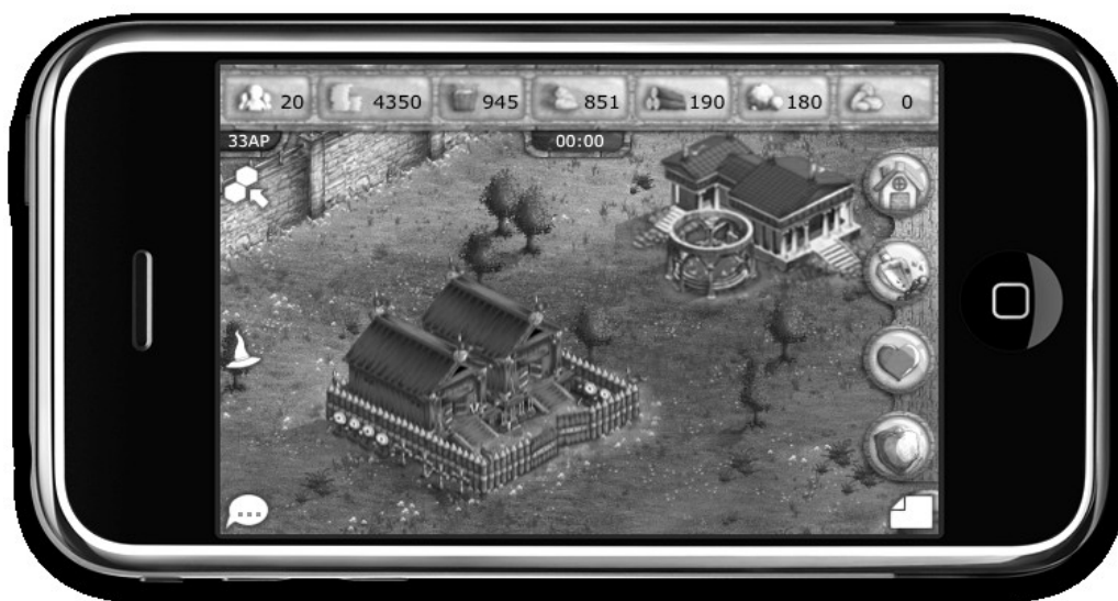
Figure 2: Zoomed in partial view of a town showing barracks and embassy

As students play Statecraft X , many challenges come their way. Apart from having to meet the basic needs of citizens in the town, such as needs for food, water, and housing, they must also develop and sustain a thriving economy. In order to do so, they must trade with neighboring towns to acquire the resources needed to build factories, healing centers, and army barracks. These resources comprise wood and ore. By design, however, each town can produce wood or ore but not both. If citizens’ needs are not adequately met, they become unhappy. They may even leave the player’s town in search of a better life in another town. Trying to increase a town’s economic wealth tends to take a toll