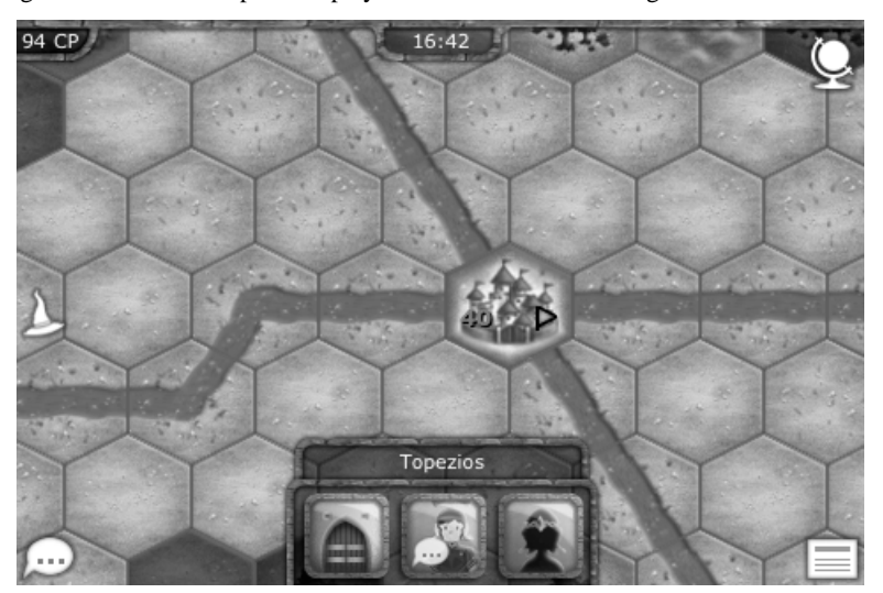
Figure 2. The world map where a player has entered another town and has a range of options.

Statecraft X is set in the fantasy kingdom of Velar, which stands without a ruler after the death of a wise and capable king. Over the course of three weeks, students play in groups of four or five, where they represent factions fighting for control, influence and power over Velar, and to control the capital city Topezios. The four factions are Dragon, Pegasus, Phoenix and Griffin. Within each faction, each player starts off as a governor of a town. Statecraft is innovative in giving each player the option to vary and manipulate their town's development pertaining to issues like housing, healthcare, defense and the acquisition and production of resources. Adding on to this flexibility is the complexity of adjustable tax rates, workers' wages and even limitations on the skill level and trainability of workers and citizens who have decided to make a particular player's town home, seen in Figure 3.