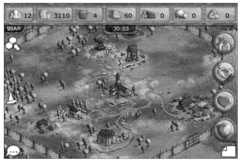
Figure 1. The town map where players have access to buildings and their functions.

Role-Playing Game or MMORPG for twenty plus players, where game play is only possible with teams of participants, and players navigate through town, world map and specific in-game action menus on their iPhone screens, like the town map shown in Figure 1.