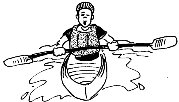
More appropriate modes of exercise for overweight children.

of normal weight. However, because of their greater body mass, obese or overweight young people may expend more energy than those of normal weight despite their lower levels of physical activity;