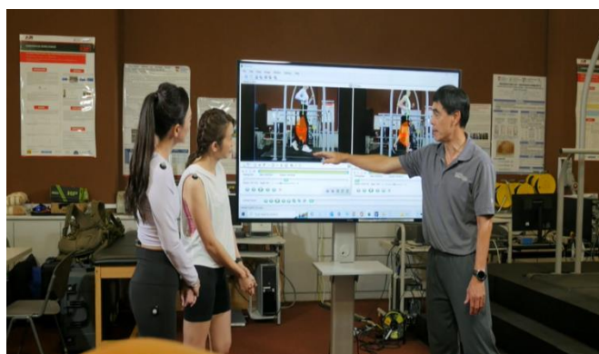
狮城有约 | 十分访谈：东南亚运动会