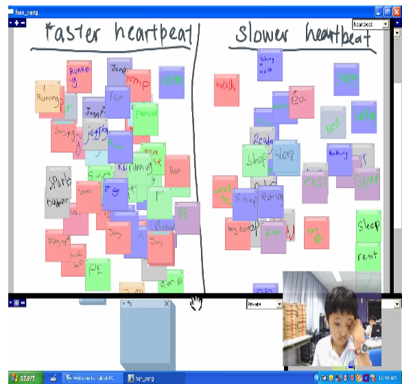
Figure 1: A Morae screenshot of the public or group board (upper pane) and private board (lower pane)

In collaborative classrooms, groups of learners and their teachers routinely work in more complex configurations than lecture-based classes. They take roles, contribute ideas, critique each other’s work, and together solve aspects of larger problems, all to good effect (Hake, 1998). Managed flow of information and control is essential to the structure of many of these successful educational activities (Guribye, Andreassen, & Wasson, 2003).