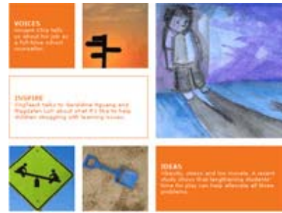
Issue 12 - 2008