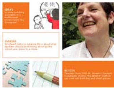
Issue 9 - 2007