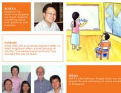
Issue 8 - 2007