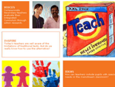
Issue 6 - 2007