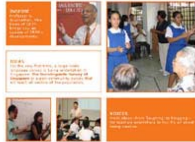
Issue 2 - 2005