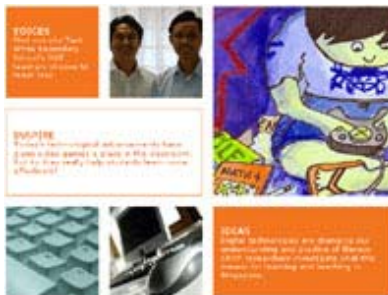
Issue 5 - 2006