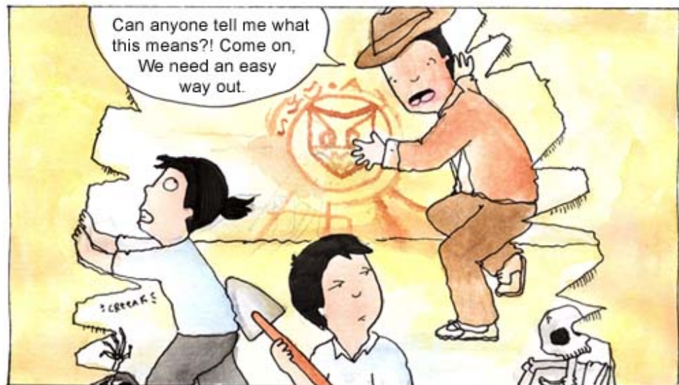
"Teaching" in movies