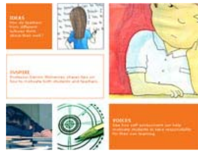
Issue 10 - 2008