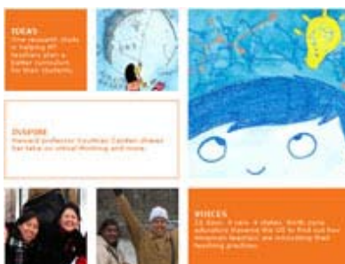
Issue 7 - 2007