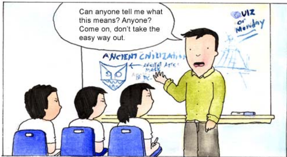
"Teaching" in real life