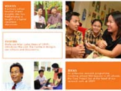
Issue 1 - 2005