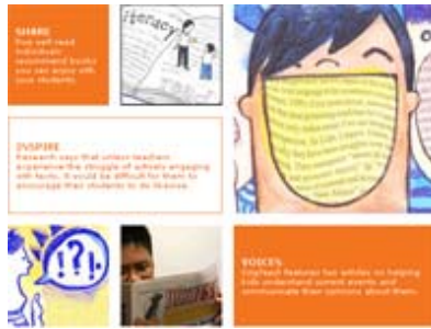
Issue 11 - 2008