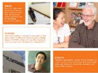
Issue 3 - 2006