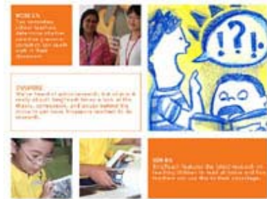
Issue 4 - 2006