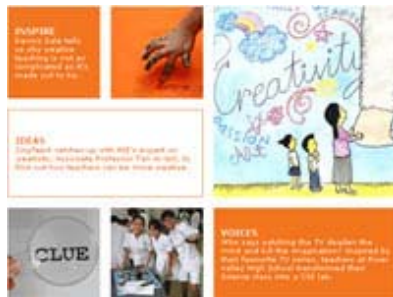
Issue 13 - 2008