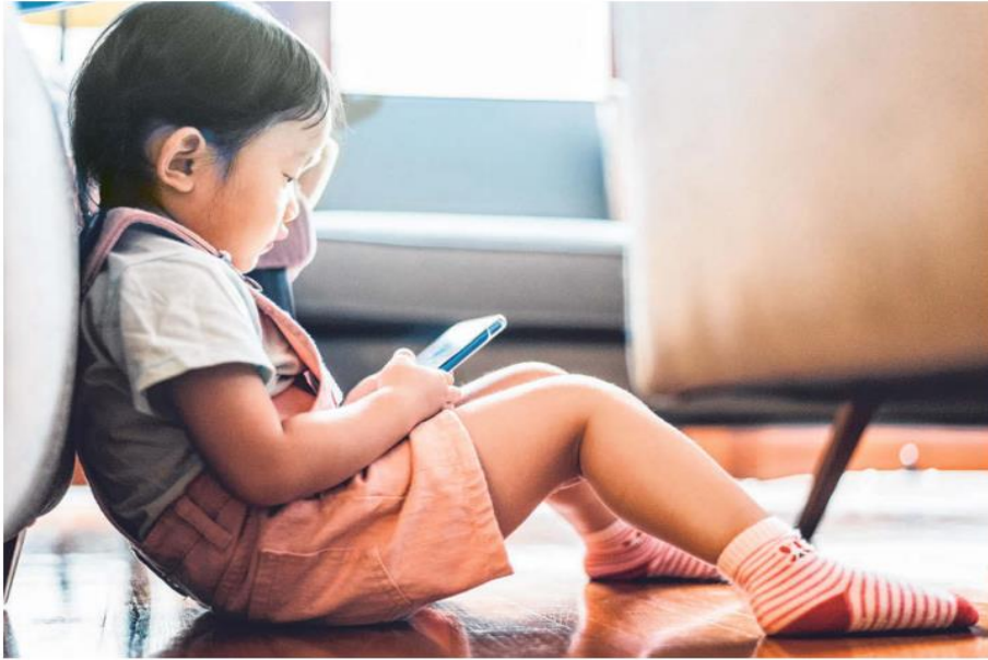
The National Institute of Education study found that screen time among pre-schoolers increased from 1.75 hours to 2.15 hours a day during the pandemic.

Pre-schoolers in Singapore are getting less physical activity and sleep, but spending more time on screen devices during the pandemic, found the latest study by the National Institute of Education (NIE). In fact, worryingly, they are clocking more than twice the amount of screen time recommended by the World Health Organisation (WHO) – a trend already happening in the last few years and made worse by the pandemic. The three-year study began in March last year and coincided with the start of the pandemic. There were more than 2,500 responses from parents whose children aged two to six attend government-funded pre-schools. This sample is nationally representative in terms of ethnicity, education and age of parents. Principal researcher Professor Michael Chia, from NIE’s department of physical education and sports science, says the aim of the research is to look at digital media use by pre-school children and its impact on behaviour, play and sleep outside of school. He has been researching the effects of physical inactivity in youth for the last 25 years.