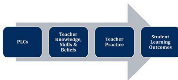
Figure 2: Impact of PLC

teacher knowledge, skills, beliefs and practice (Figure 2). PLCs, like other teacher professional development platforms or models, must bring about the development of teacher knowledge, skills, beliefs and practice (Darling-Hammond et al. 2009; Guskey 2002). In addition to this, we also propose that for PLCs to truly bring about change and improvement in teacher practice, there must be the development of teacher knowledge in five aspects: 1) curriculum content, 2) pedagogy (theory of teaching), 3) instruction (practice of teaching), 4) assessment, and 5) student learning.